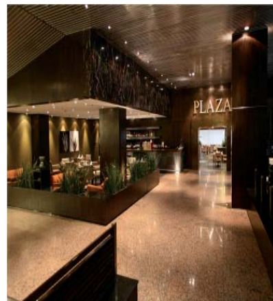
Views of our Conference Hotel, Mexico 2009