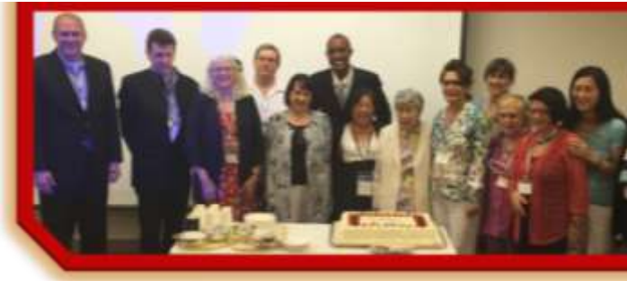
TOP: Jubilee Anniversary Cake. ICP 74 th Conference Beginning the Celebration of the association's 75 th Year. Note: Founded Dec. 14/15, 1941.