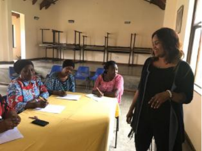
Each student trains a caregiver groups at 7 group sessions